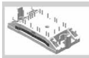
Integrated IGBT module used in IN-DSP Series Modular UPS

In the case of Discrete IGBTs, more chips need to be paralleled to obtain high current ratings. In those cases, Clamped Diodes have to be placed around IGBTs which brings risks, due to voltage/current stresses and difficulty perils in the manufacturing process.